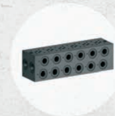
Monoblocks | parallel circuit