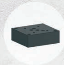
Conversion plates, adapters and measurement spacers